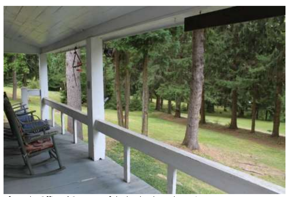
View from the Officers' Quarters of the lands where the main camp structures once stood.