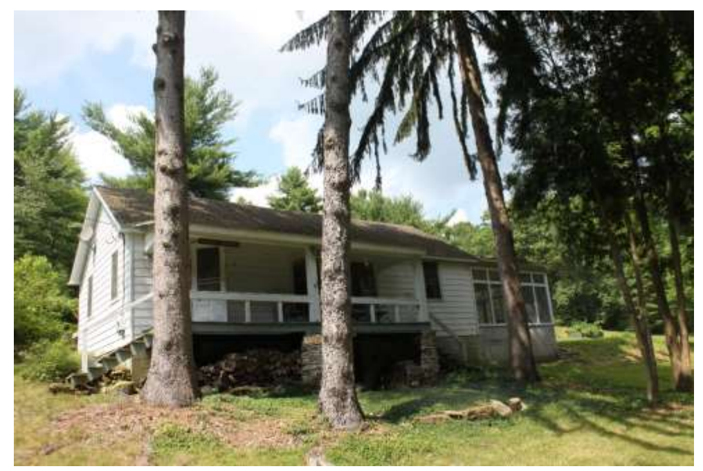
One of the three remaining structures of the camp is the Officers' Quarters shown.