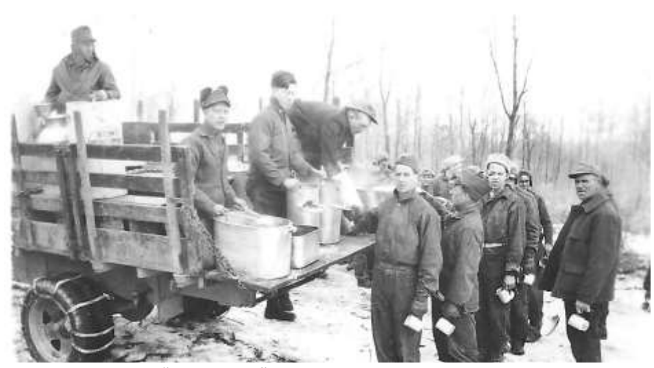
"Field Lunch" at the Poe Valley CCC Camp