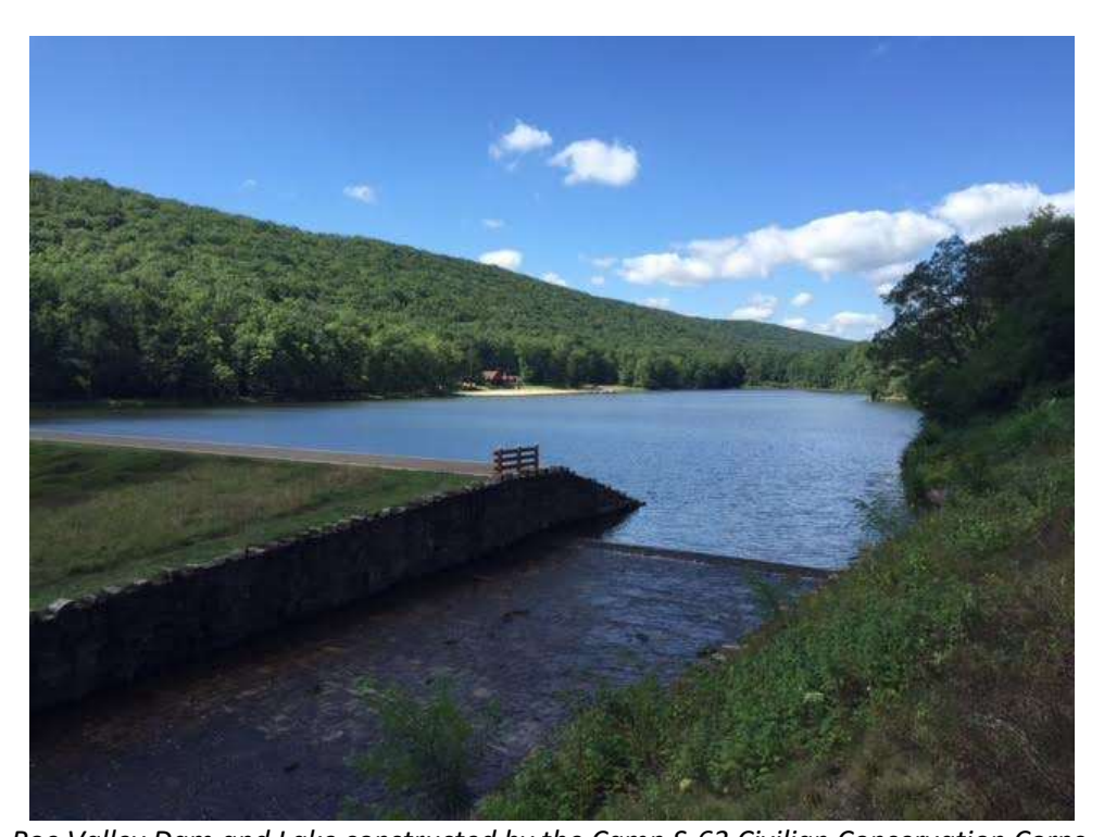
Poe Valley Dam and Lake constructed by the Camp S-63 Civilian Conservation Corps.