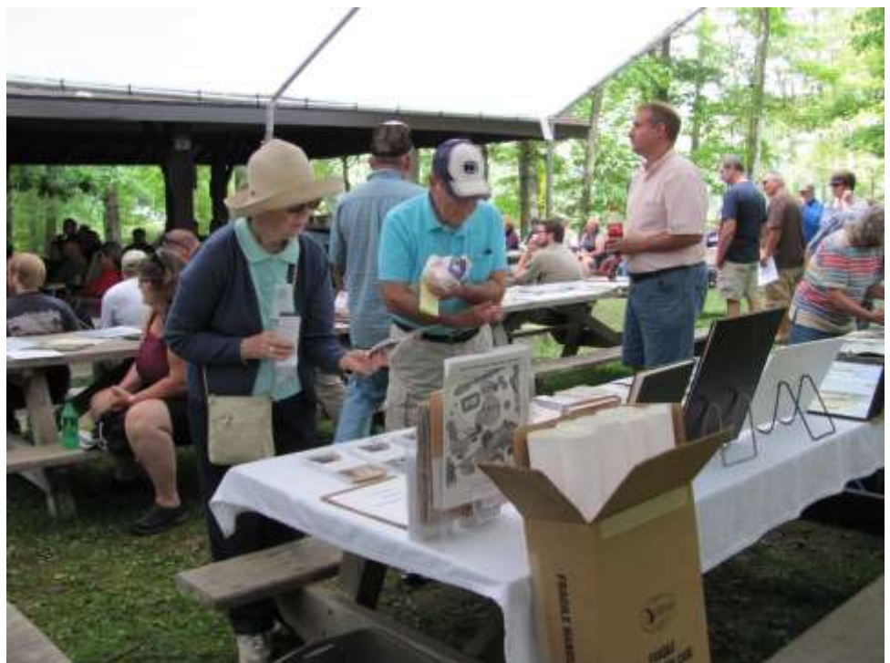
Displays at the 2016 CCC Legacy Day.