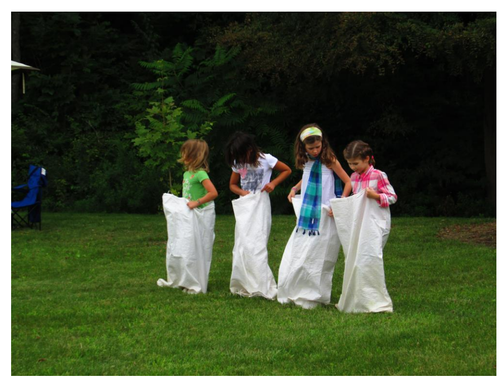
Students playing sack races at the school.