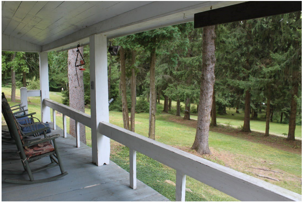
View from the Officers' Quarters of the lands where the main camp structures once stood.