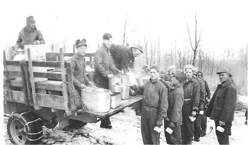
"Field Lunch" at the Poe Valley CCC Camp