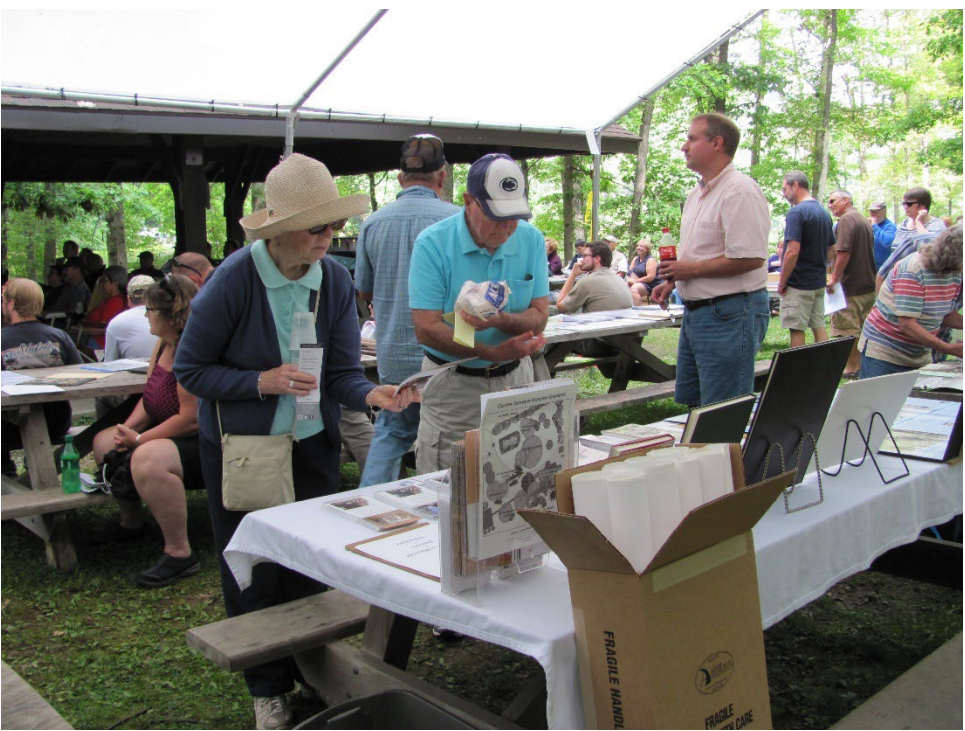
Displays at the 2016 CCC Legacy Day.