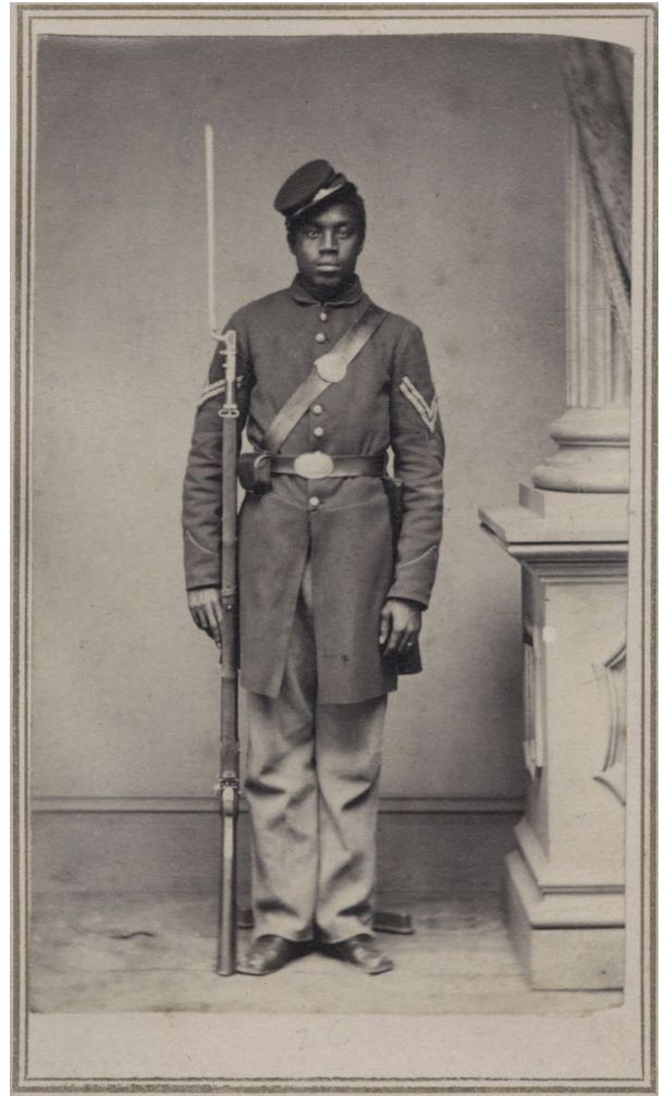
An African American Corporal