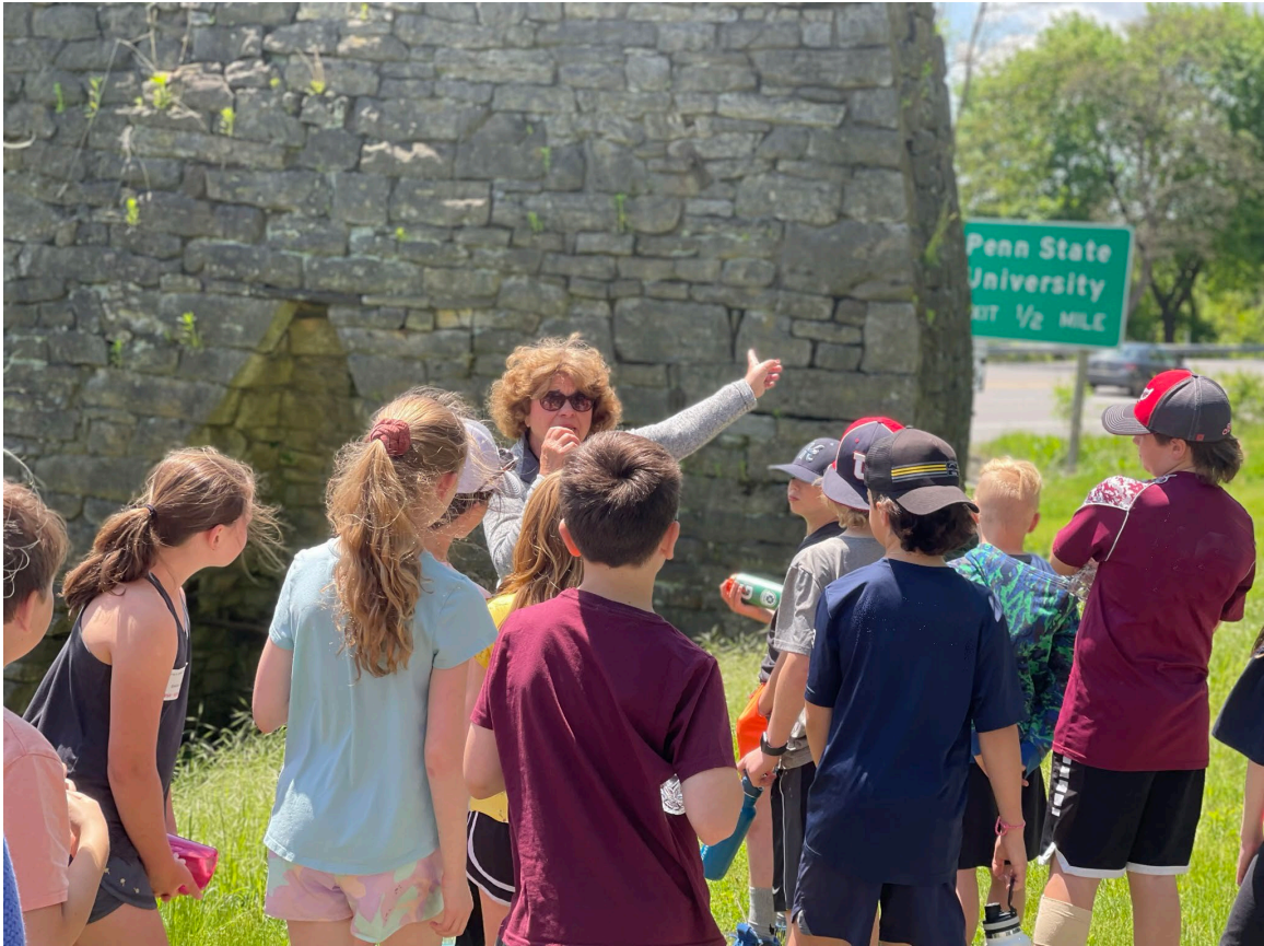
Tour of the Centre Furnace Stack