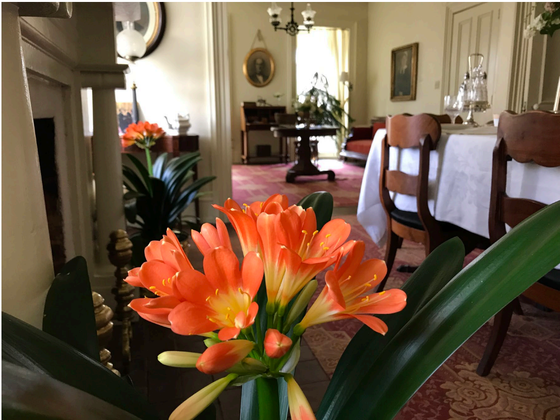
Dining Room and Founders Room at the Centre Furnace Mansion