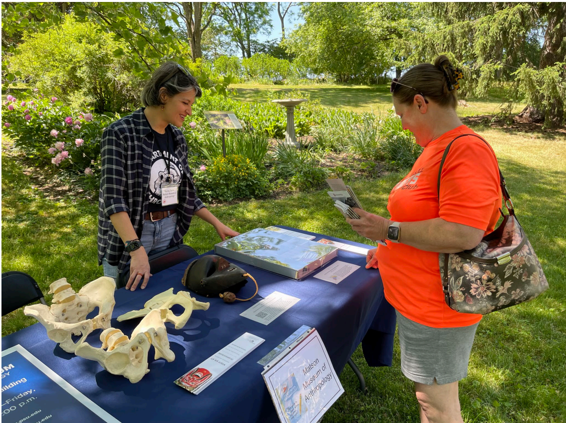
Matson Museum of Anthropology at Penn State Display at the 2023 Centre County Explorers Day