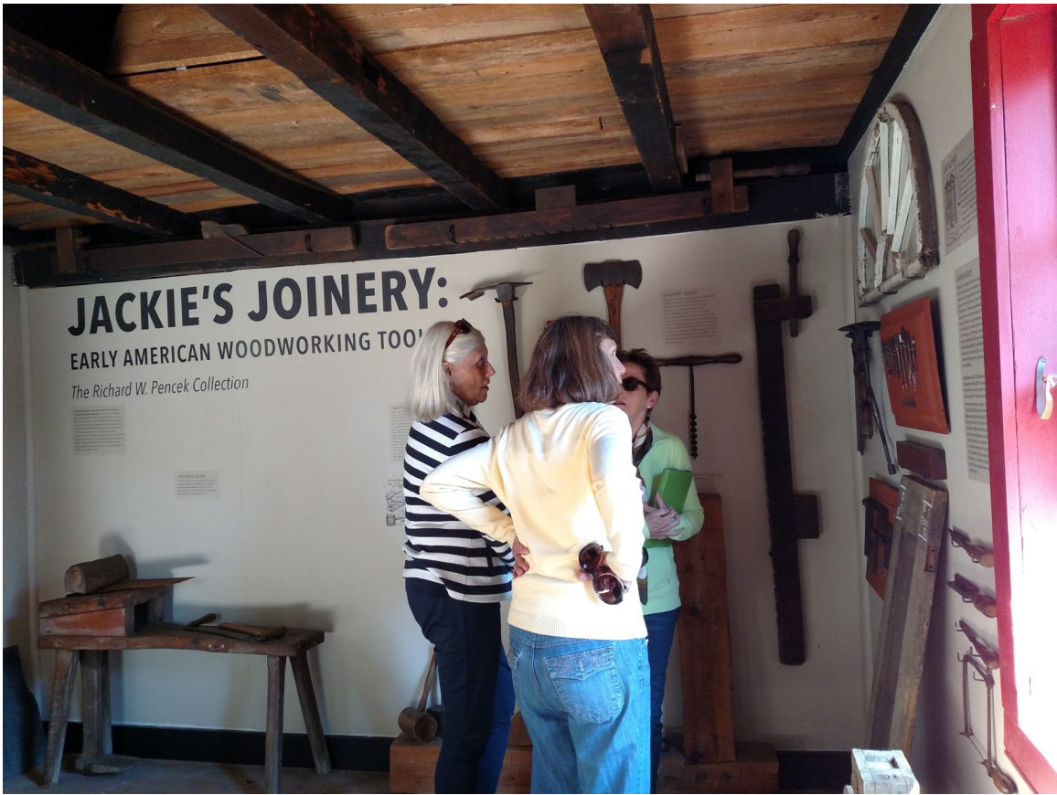
Jackie's Joinery Early American woodworking tools exhibition.