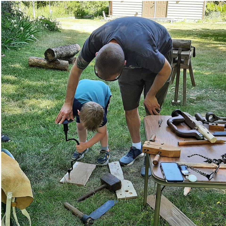
Making holes for pegs to be used in nineteenth century log construction.