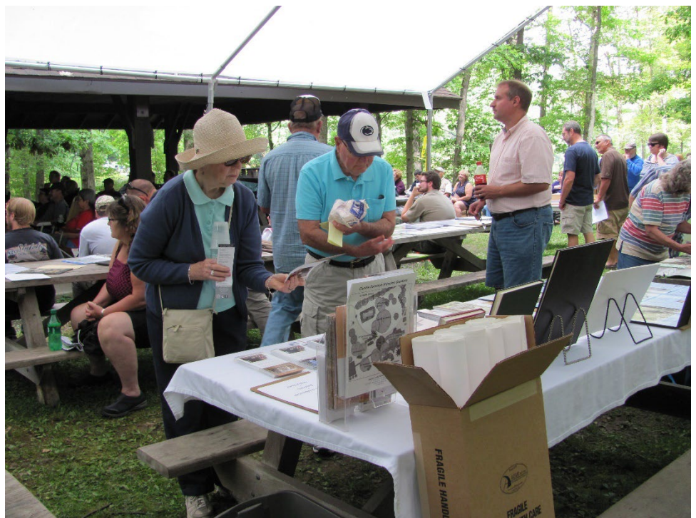
Displays at the 2016 CCC Legacy Day.