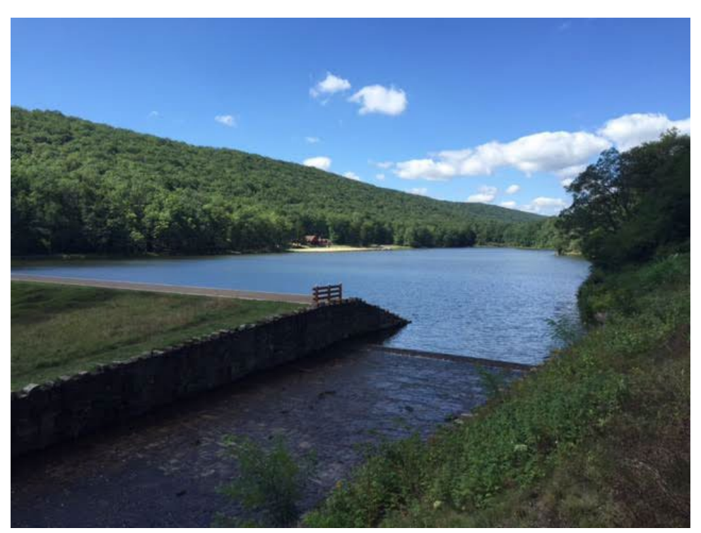
Poe Valley Dam and Lake constructed by the Camp S-63 Civilian Conservation Corps.