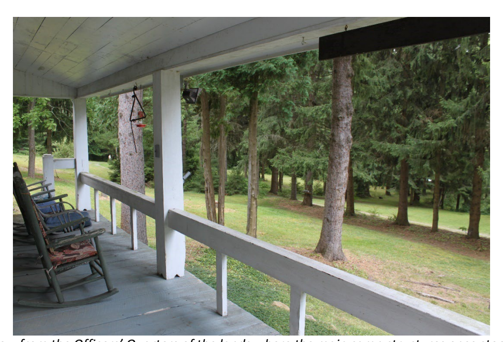
View from the Officers' Quarters of the lands where the main camp structures once stood.