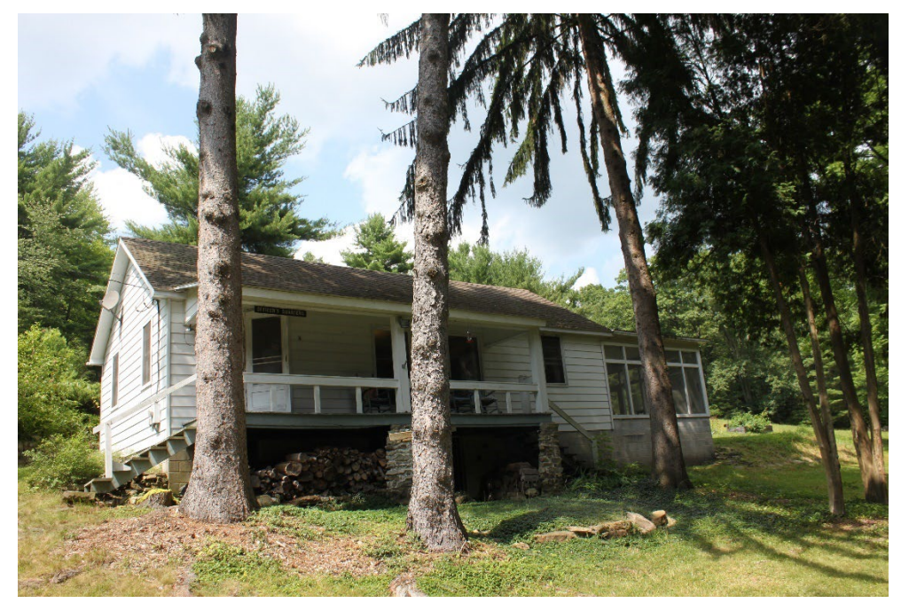
One of the three remaining structures of the camp is the Officers' Quarters shown.