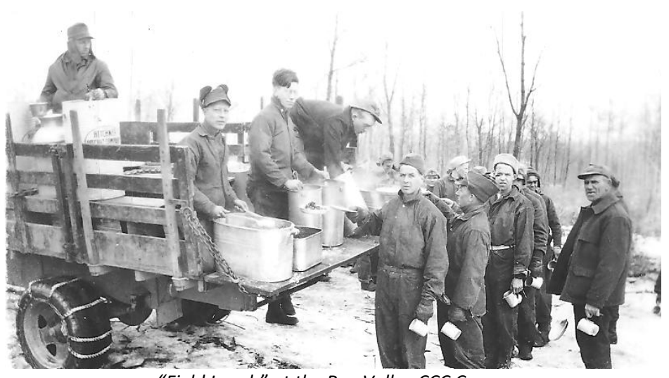
"Field Lunch" at the Poe Valley CCC Camp