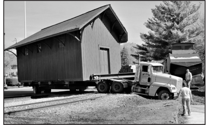
Moving of the Bellefonte Freight Warehouse.