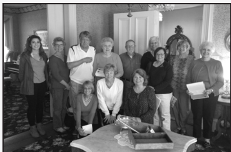
CCHS Docent Committees

Docent meetings held in the Centre Furnace Mansion Hearth Room.