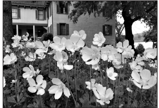
Wood anemone, Anemone Quinquefolia

9:00 a.m. - 2:00 p.m. @ The Centre Furnace Mansion