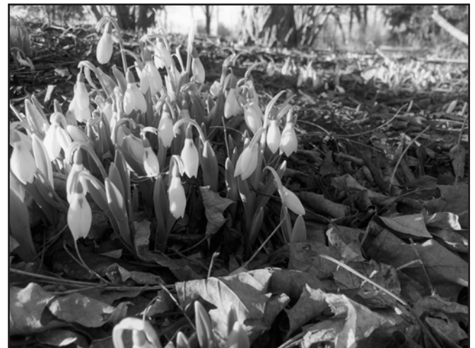
Snowdrops in the Shrub Bed.