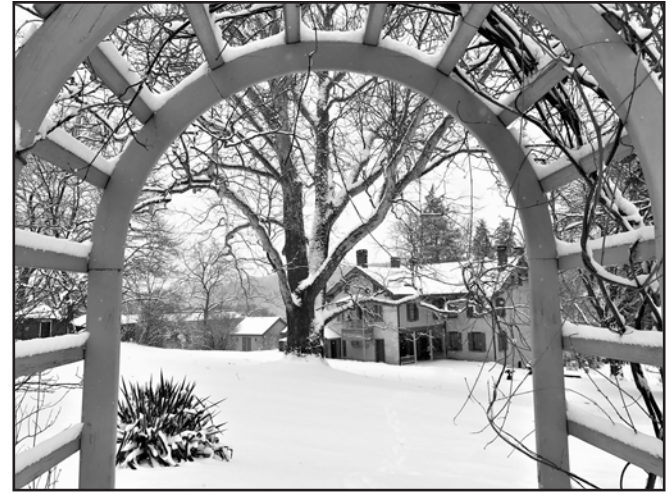
Snowy view of the Centre Furnace Mansion from Upper Garden.

Snowdrops have been blooming at the Mansion now for almost a month, sometimes covered with a blanket of snow and sometimes not! As the spring ephemerals start to push through the leaves, the Centre Furnace Mansion Gardeners are also pushing ahead with plans for the gardens.