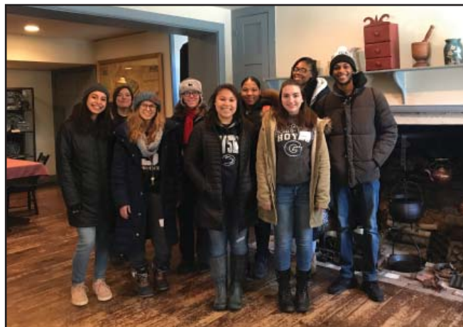
On Monday, January 21, we welcomed Penn State students for the annual Martin Luther King Jr. Day of Service. These students helped inventory the CCHS library so that we can keep our database up to date.