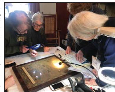
Volunteers documenting a sampler dated 1807.