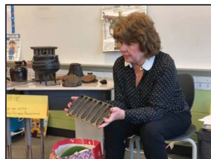
Photo shared on Radio Park Elementary School's Facebook page.