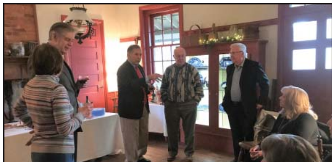
The first gathering of the Jacqueline J. Melander Society held on December 16.