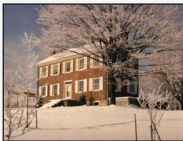
Leonard Rhone House at Rhoneymeade. www.rhoneymeade.org