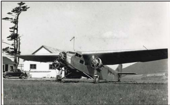
Ford Trimotor at the State College Air Depot in Boalsburg, 1935. Note the old Boalsburg pine tree in the background.

Sun/Wed/Fri @1:00 - 4:00 p.m. or by appointment