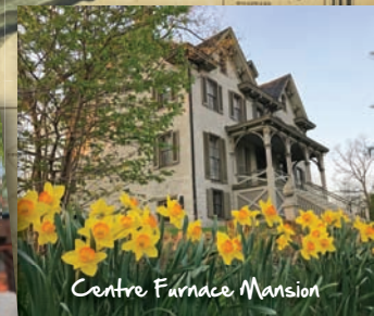
Centre Furnace Mansion