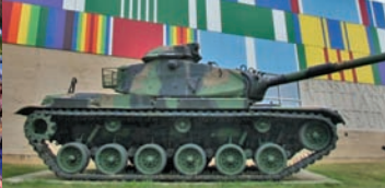
PA Military Museum — Boalsburg